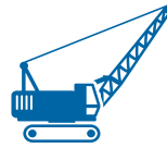
LATTICE BOOM CRANES